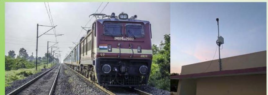
AWS installed at Abu Road Railway Station

On the request of North West Railways Ajmer Division for establishment of Wind Systems on Ajmer- Palanpur section in view of the problem being faced intrain operations especially during high winds, India Meteorological Department has made provision for Establishment of Wind Systems enroute of Ajmer – Palanpur Stretch at 19 locations - ABU Road, Kivarli, Madar, Ajmir, Mangliawas, Kharwa, Beawar, New Bar, Chandawal, Sojat Road, Marwar, Binwaliya, Rani, Falna, Jawal Bandh, Nana, Banas, Sarotra Road & Karjoda. Installation of AWS at these locations has already been initiated.